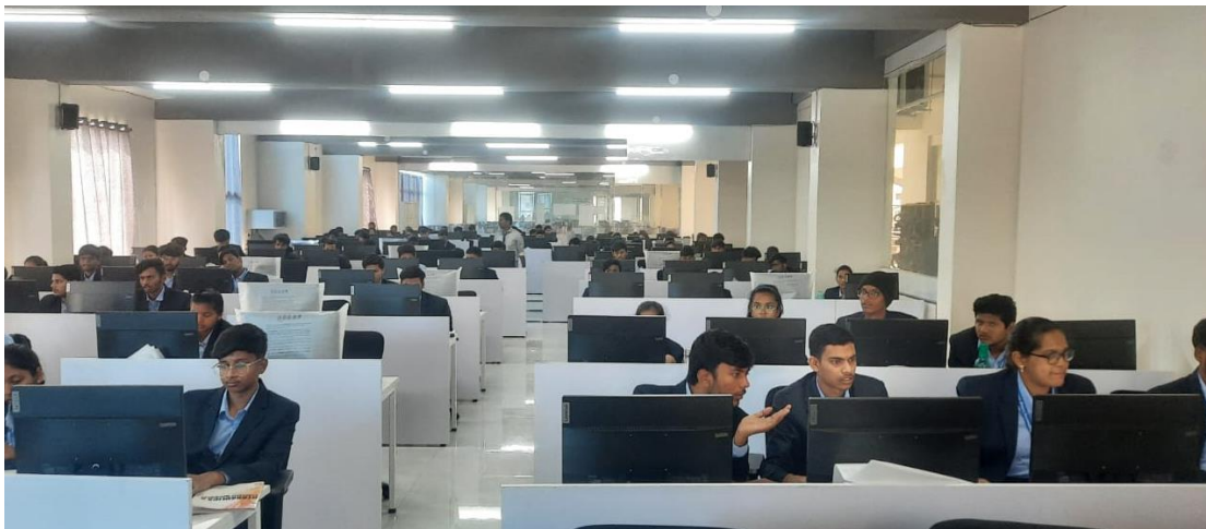
14/03/2024, 9:20AM-11:50 AM-(AI&ML, EEE Room No.7113)