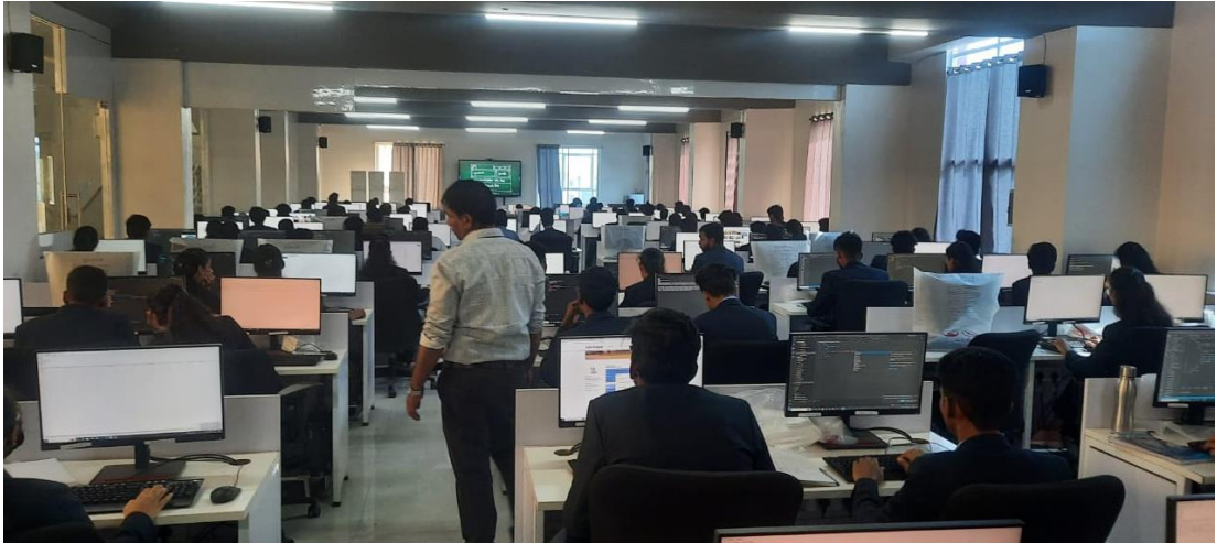
14/03/2024, 9:20AM-11:50 AM-(ECE: Room No.7112)