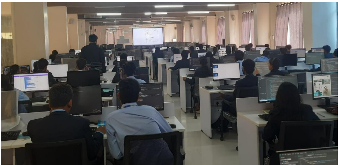
14/03/2024, 9:20AM-11:50 AM-(CSG: Room No.7310)