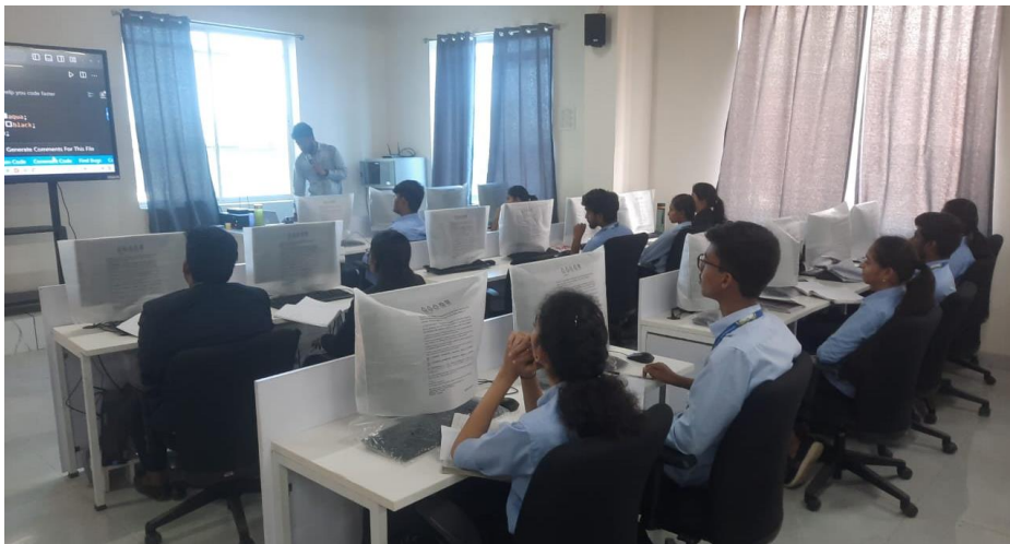
14/03/2024, 1: 20PM-3:50PM (CSE(AI&ML)-B ,C & IT-C: Room No.7310)