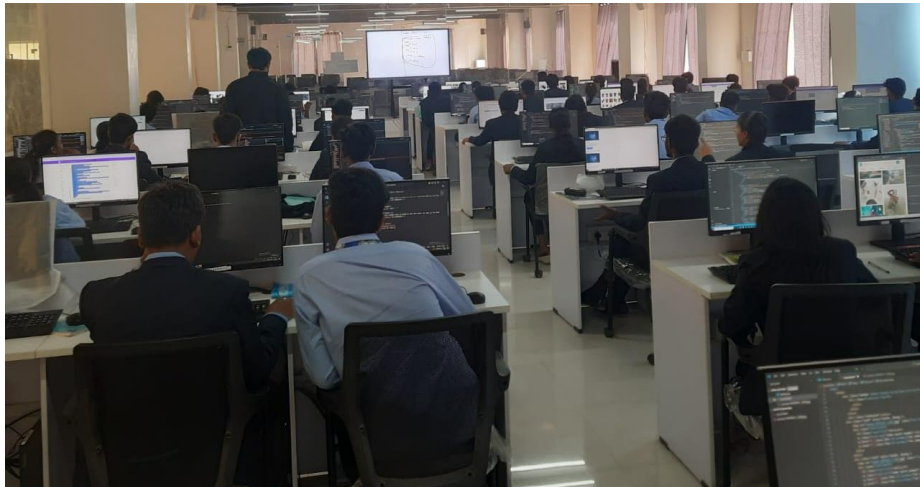
14/03/2024, 1:20PM-3:50PM (CSE(AI&ML)- A& B IT- C: Room No.7113)